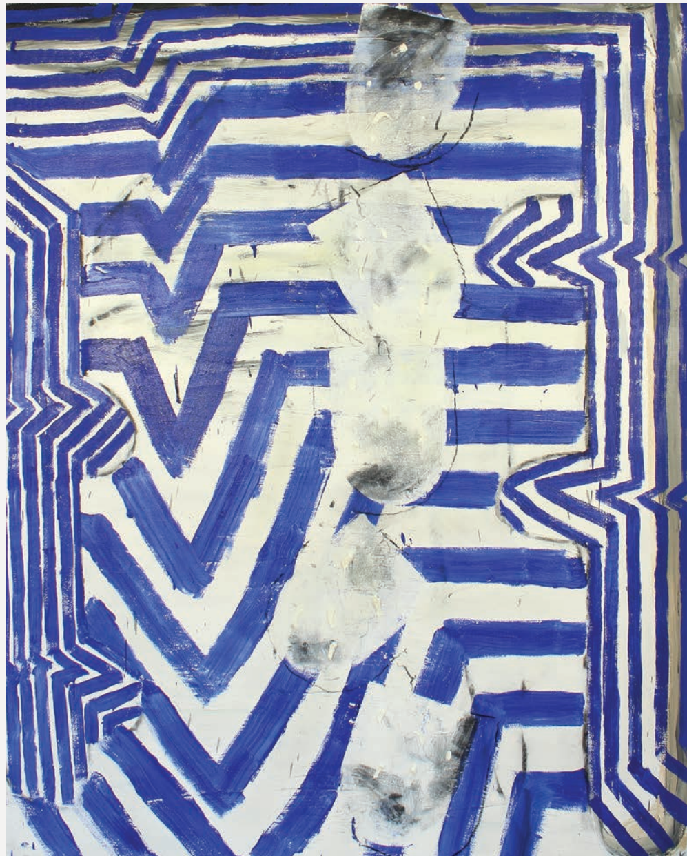
Swept In , 2017, oil on canvas, 84 x 66 inches