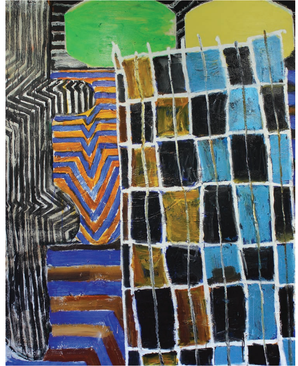
Stacked , 2017, oil on canvas, 84 x 66 inches