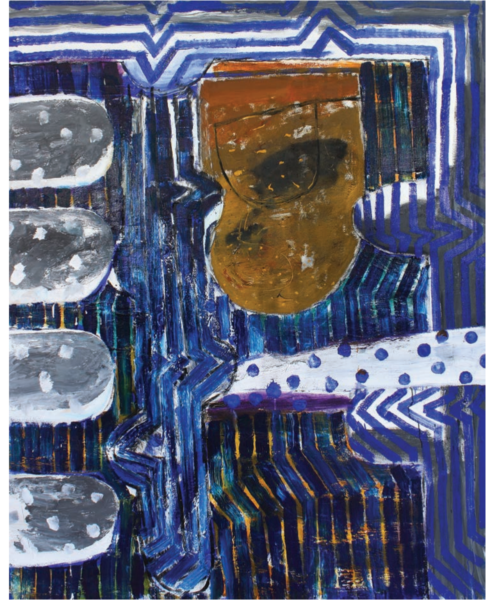
John's Bay Pollution , 2017, oil on canvas, 84 x 66 inches

Homer, for all his painterly bravura, makes his medium disappear into his evocations of light-struck breaking waves and churning surf. Walker – as we expect of a modernist painter – celebrates paint. His lush surfaces and generous gestures remind us of the artifice of painting and of the presence of his hand in constructing the image. Walker clearly loves the juiciness of oil paint and relishes the act of moving it across the canvas. Rather than dissembling his medium in the service of illusionism, as traditional painters like Homer do, Walker makes the materiality of paint and the fiction of painting into abstract equivalents for his experience of place. He suggests not the appearance of the ocean shore, but its smells and temperature, its mutability,